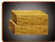
Fireproof door material